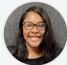
Zaire Volunteer Coordinator