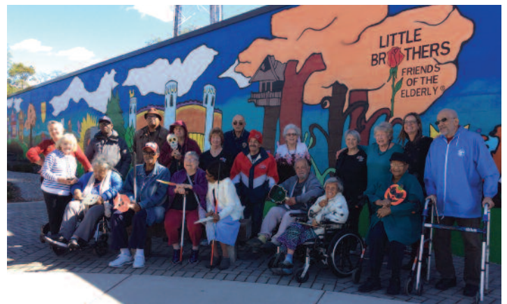
The Third Thursday Group

Third Thursday is indeed a special time each month for sharing, caring, laughing and loving with our elderly friends.