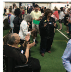
Dancing the night away at the Senior Prom

On May 3, the Cincinnati Sports Club's indoor soccer field was transformed into a dance hall filled with care, love and fun. 200 people in attendance knew from the moment they entered the Sports Club that they were in for a treat.