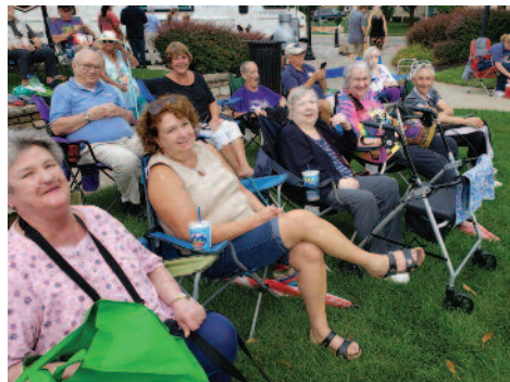
The Groovin' Gang

Summer seems to come and go so fast. At LBFE we try to stretch the summer out as long as possible so we can get as many outings in as possible. Our outings go from May to early October. This also includes our 4th of July party and our picnic at home for those not able to attend an outing.