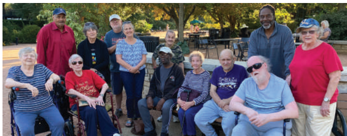
The gang enjoying time at the Morton Arboretum