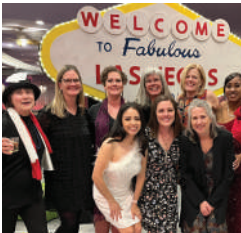
The Fabulous Gala Committee